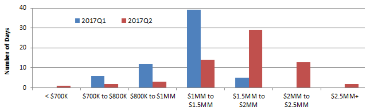
CHART 1: Distribution of Daily 99% Confidence 10-Day Hold VaR Statistics for the Total Trading Portfolio

2 Components of the aggregate VaR may at times be positive due to changing risk factors throughout the quarter.