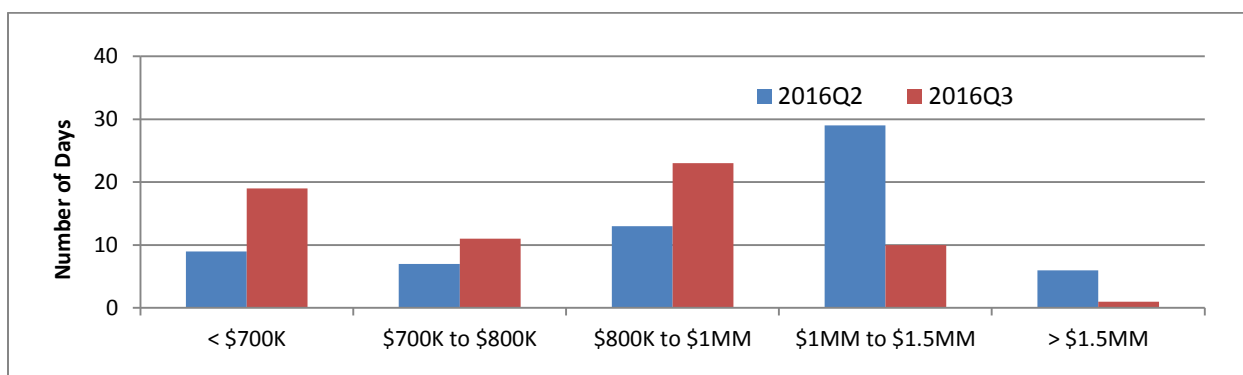
CHART 1: Distribution of Daily 99% Confidence 10-Day Hold VaR Statistics for the Total Trading Portfolio